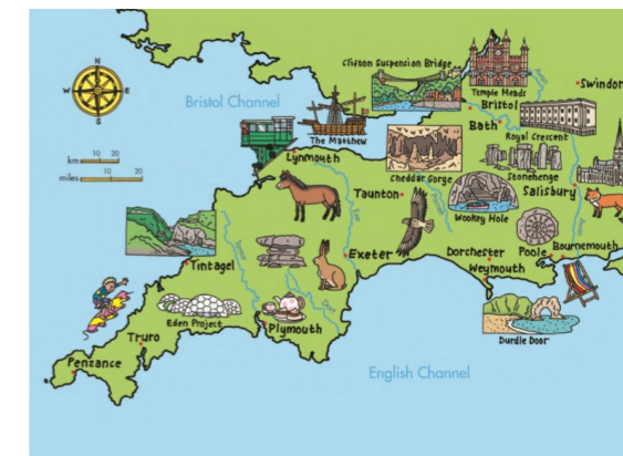
The South West