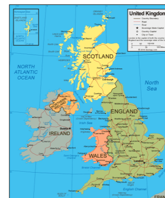
The United Kingdom