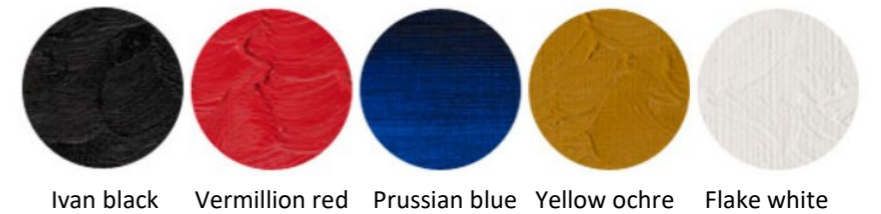
Ivan black Vermilion red Prussian blue Yellow ochre Flake white