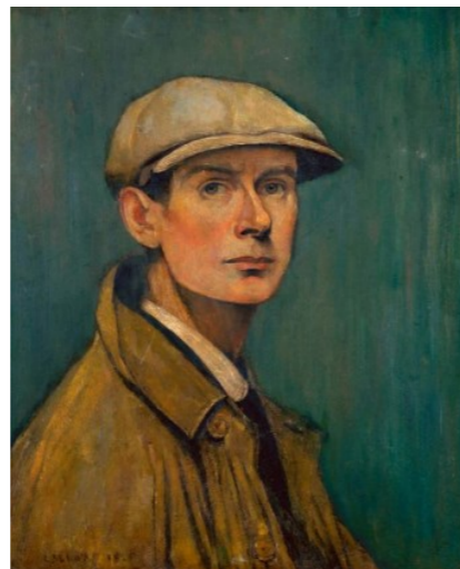
LS Lowry self portrait