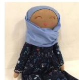
Bushra is a Muslim